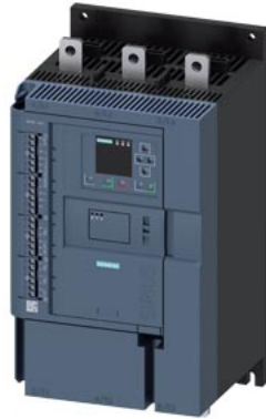
SIRIUS soft starter 200-480 V 210 A, 110-250 V AC Screw terminals